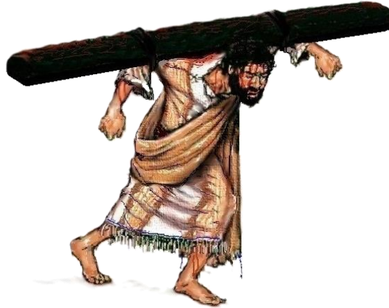
Criminal carrying his ‘cross’ ( patibulum ) or crossbar.

“I have been crucified with Christ and I no longer live, but Christ lives in me. The life that I now live in the body, I live by faith in the Son of God, who loved me and gave himself for me.” Galatians 2:20