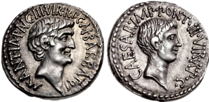
Denarius of Gaius Julius Caesar Augustus, and of Marcus Antonius, struck at Ephesus in 41 BC. In 33 CE, a denarius was the daily wage of a Roman soldier.