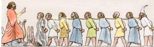
Jewish prisoners during the Babylonian Captivity. Hand-colored woodcut