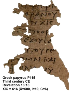
Greek papyrus P115 Third century CE Revelation 13:18 XIC = 616 (X=600, I=10, C=6)

A century later, many Christians were Gentiles who spoke Latin and did their gematria from Latin. They calculated Nero Caesar's Latin name, NERO CAESAR, to equal 616 in Hebrew letters: (נרו קסר = nrô qsr , with one long 'o' vowel). So, someone altered a copy of the Book of Revelation to read 616.