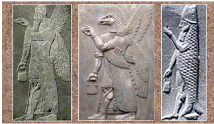
Apkallu carrying 'banduddu' bag containing a purification pine cone.