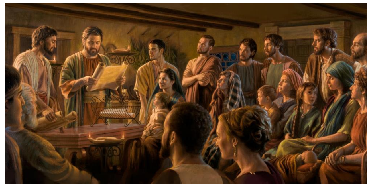
Hellenistic Jews and Christians read scripture and other literature in Greek

The recipients seem to have been located outside of Judea, for they sent financial aide to the Judean churches (6:10).