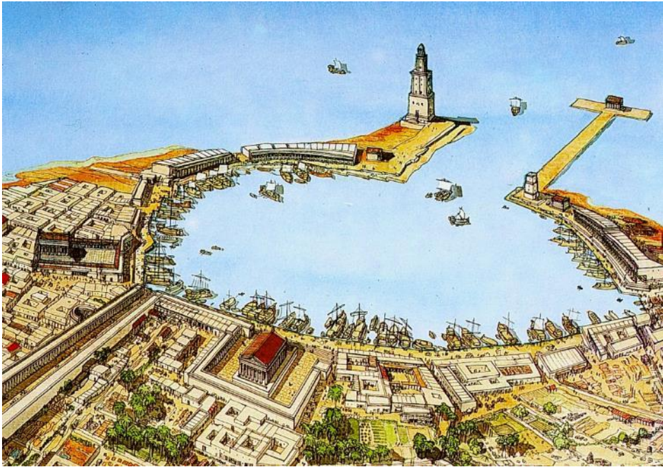
Ancient Alexandria, Egypt, a Greek-speaking city

This was possibly Alexandria, Egypt, where the Hebrew Bible had been translated into Greek, which is often cited in Hebrews.