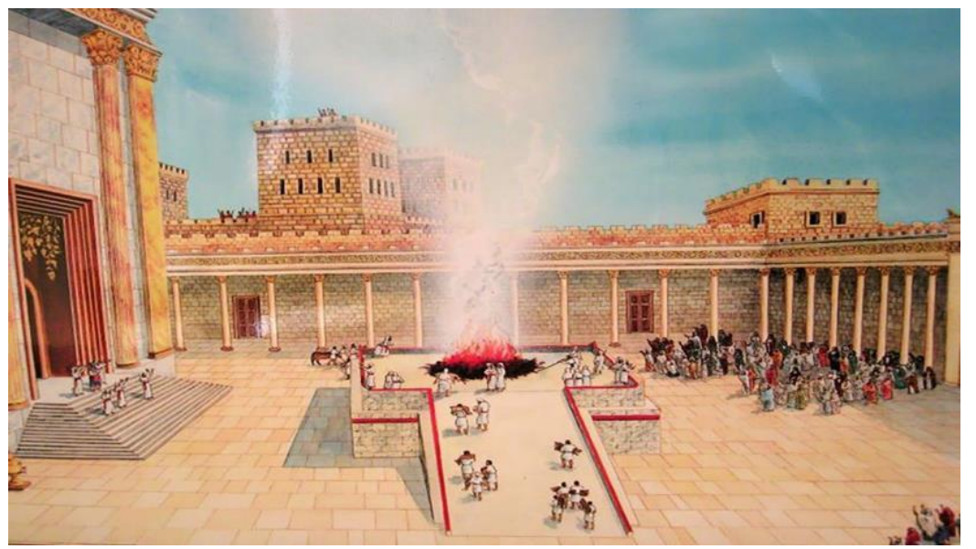
For a thousand years, Jews brought animal sacrifices to the Jerusalem temple

It was probably written before 71 CE, because, although Hebrews refers only to tabernacle sacrifices, the danger of first-century Christians reverting to Judaism would have entailed making temple sacrifices, which ceased in 70 CE.