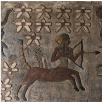
A Sagittarius, an Egyptian zodiac sign uncovered in the Temple of Esna, Egypt, completed in A.D. 250. Sagittarius was part of Babylonian astronomy brought to Egypt in Ptolemaic (Greco-Roman) times. Compare Revelation 9:3-7.