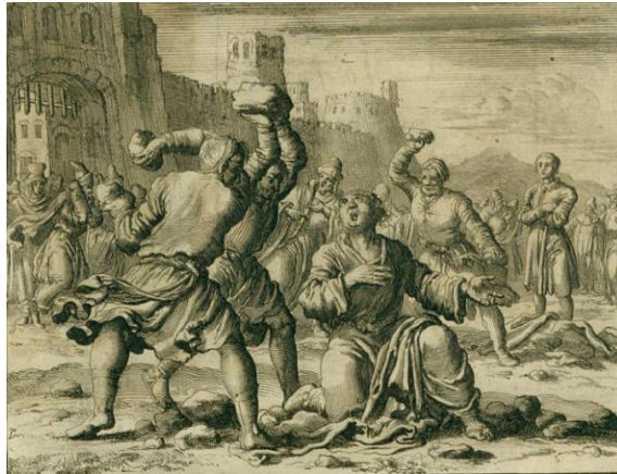
Stoning of Stephen, AD 34, 1685 - Jan Luyken

57 But they shouted with loud voices, and covered their ears and rushed at him with one mind. 58 When they had driven him out of the city, they began stoning him; and the witnesses laid aside their [own] cloaks at the feet of a young man named Saul.