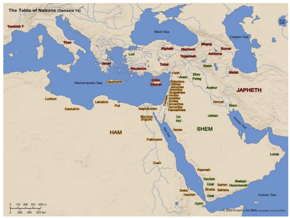
(c) 2020 Knowing the Bible LLC. Free.