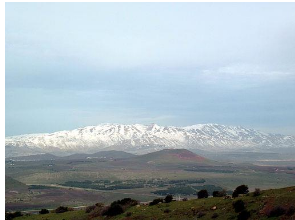
Mount Hermon in the Bashan range (Golan Heights). Caesarea Philippi to its south. Many shrines to Ba'al and other deities covered Mt Hermon, popularly known as 'the Gates of Hades'.