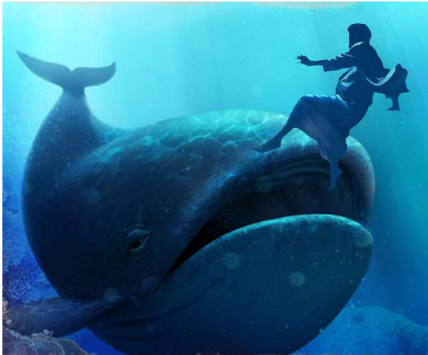
God made a great fish that swallowed Jonah and kept him alive.