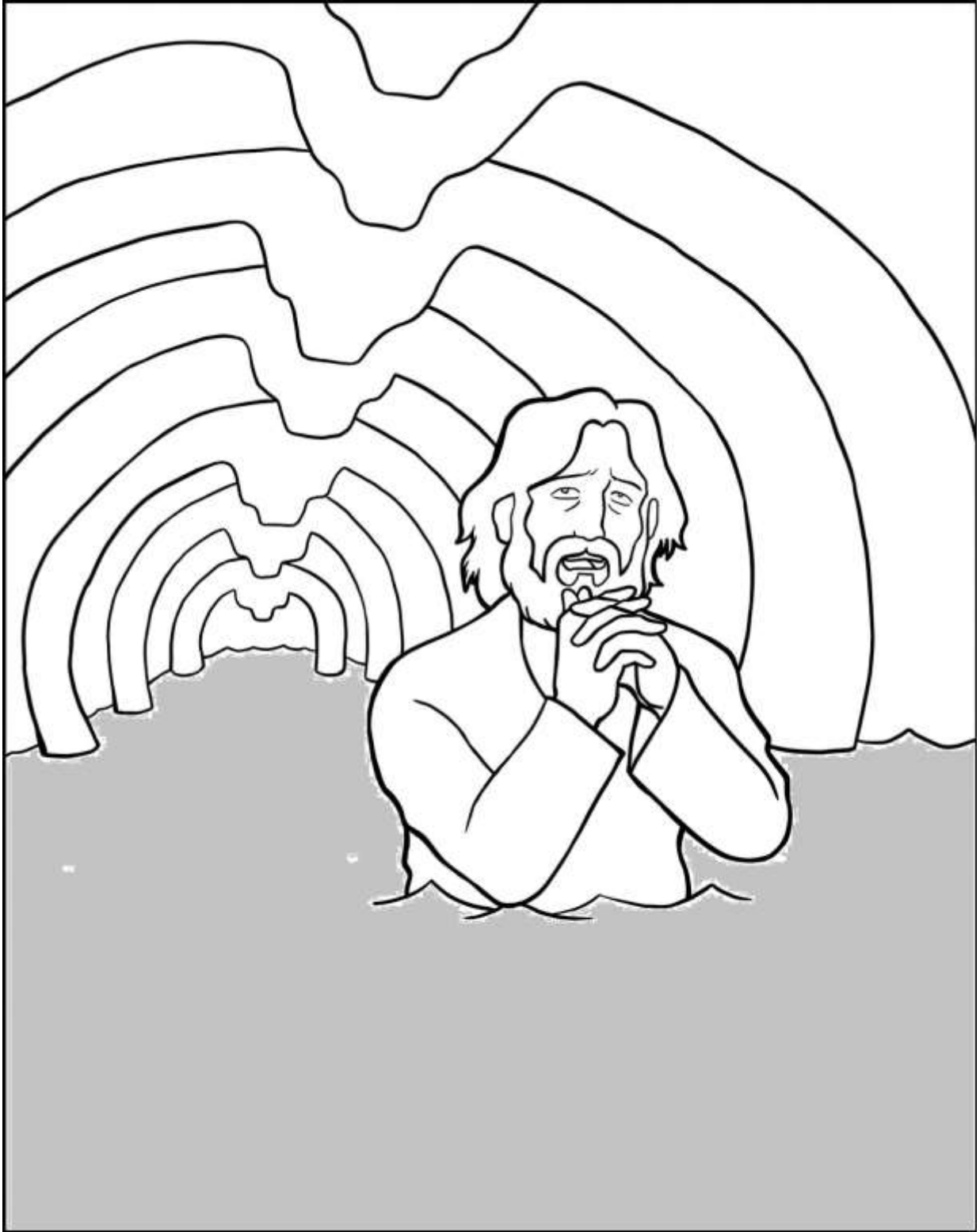
Kept alive inside a great fish, Jonah changed his mind and decided to obey the LORD.