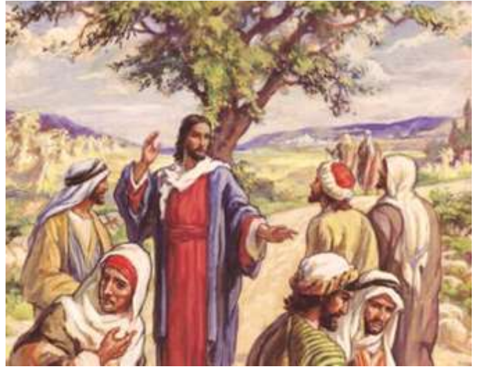
Jesus sent 72 of his followers to tell others about him.