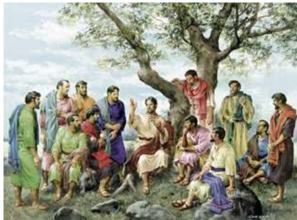
Jesus would instruct his apostle, send them out, and hear their reports afterwards.