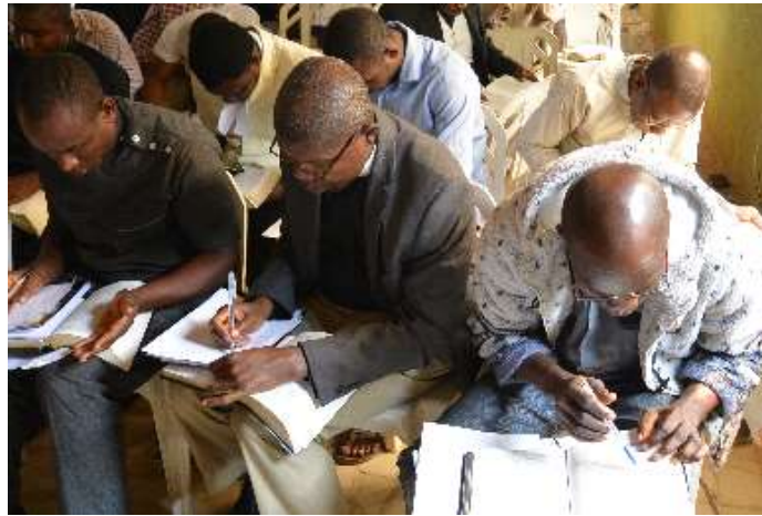
Important pastors who coach workers, also provide occasional training workshops.