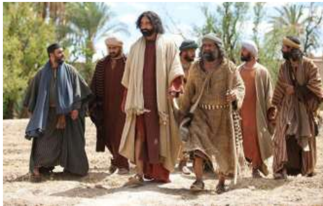
Jesus chose and called twelve disciples whom he appointed and trained as apostles.