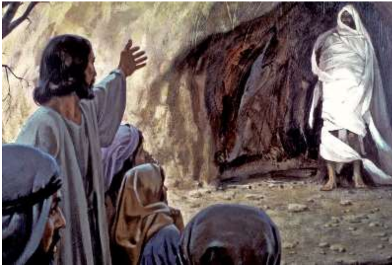
Lazarus came back to life, still wrapped in burial cloths.