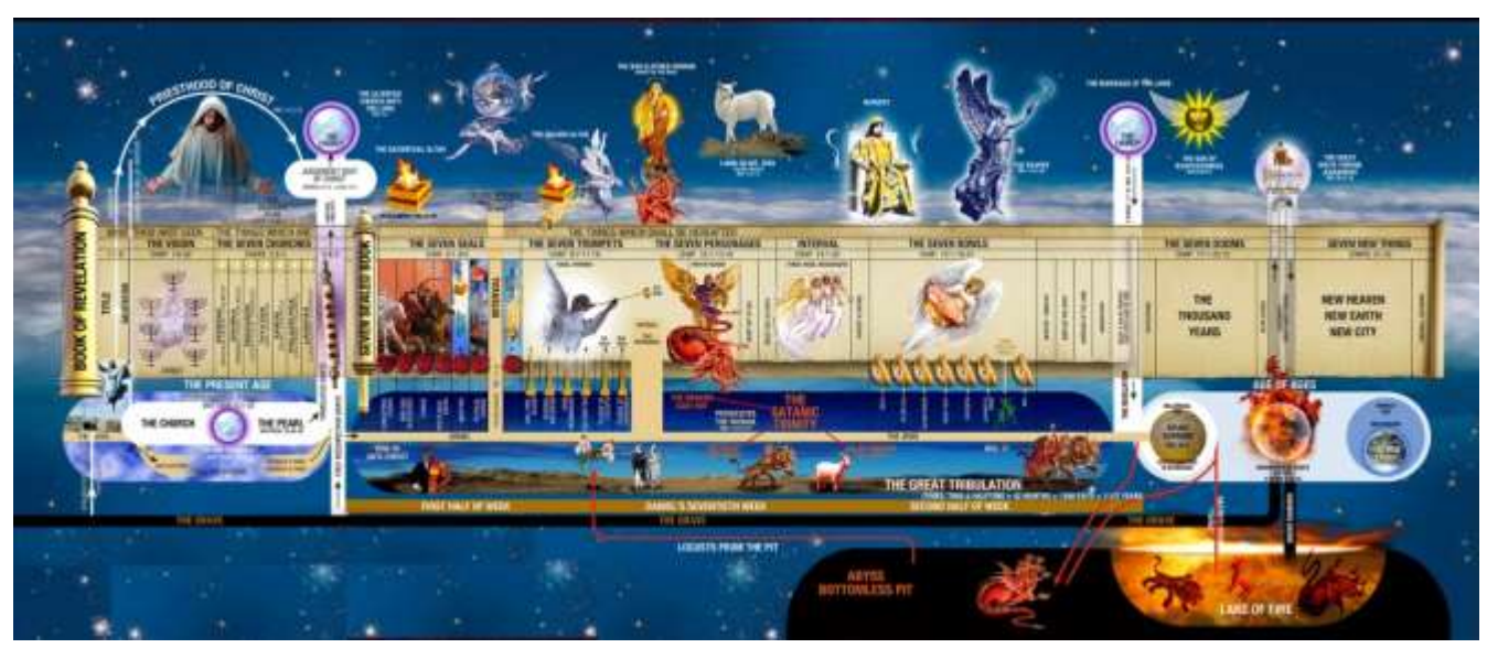
The Book of Revelation paints many exciting pictures of the end times.

[Death, hell, crying, night, sun, moon, sin, sickness]