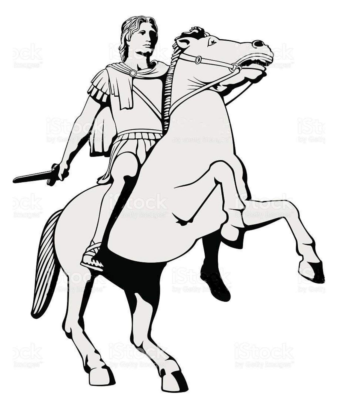
Jesus will one day return to earth as a King mounted upon a white horse.