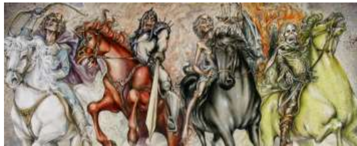
Vision of four horsemen bring woe upon the earth.