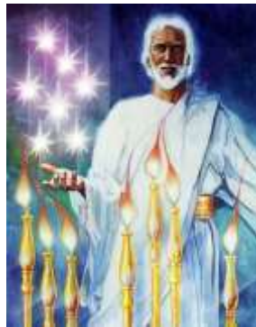
Jesus appeared to John in shining glory.