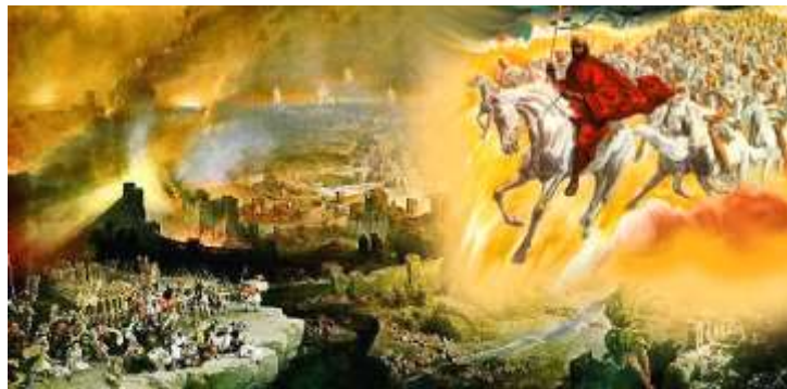
The Word of God comes riding upon a white horse.