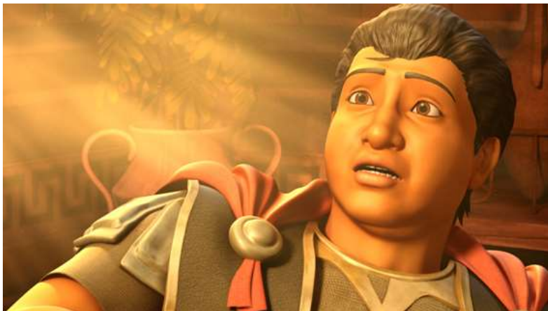
An angel appeared to a Roman soldier who believed in the God of Israel.