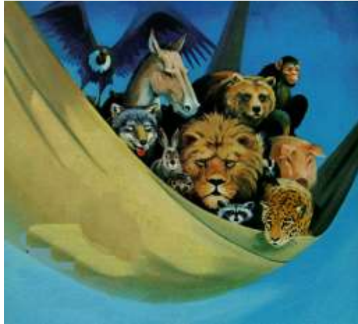
A voice from heaven commanded Peter to eat unclean animals.