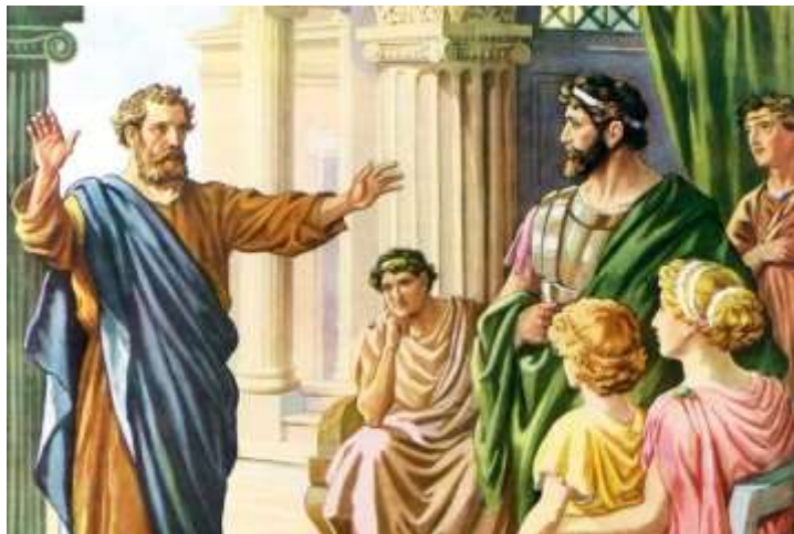
When Peter told the Good News about Jesus, all who were listening to him received the Holy Spirit.