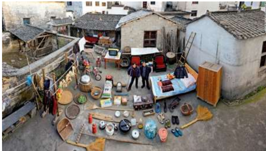
Even the poor must steward their possessions.