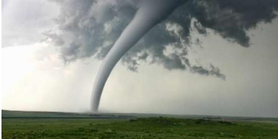
Tornados are powerful wind storms that destroy everything in their way.

Satan replies, “All a man has he will give for his life, but touch his flesh and he will curse you!”