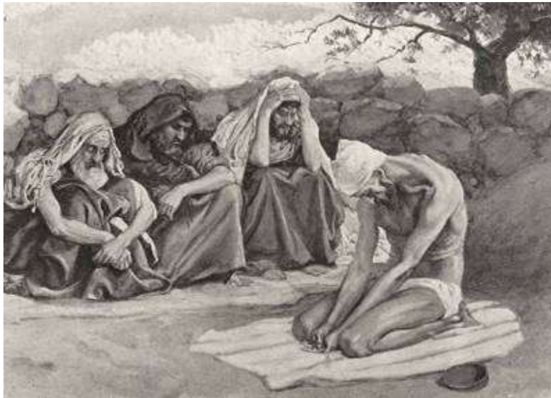
Job’s friends sit with him whilst he suffers.

Job’s three friends Eliphaz, Bildad and Zophar arrive to console him. Seeing his plight, they tear their robes and throw dust over their heads.