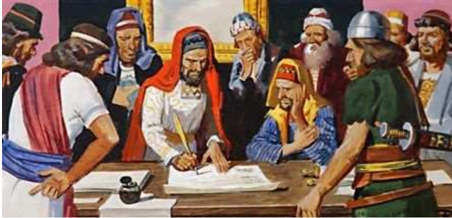
Nehemiah's enemies plotted to get the government to stop his work

Praise God for ways that Christians have worked together to serve the needs of people outside of their own flock. Ask for testimonies and reports of work done last week.