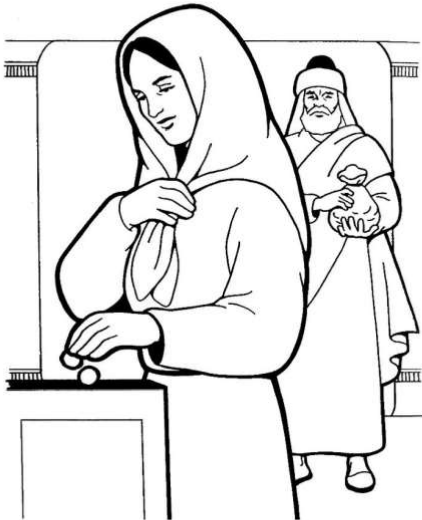
Macedonians brought gifts each week to give to the poor in Judea.

“Lord, you give to us many good things. We want to give to needy people and to those who take your Word to faraway places. Help us work together to honor you with what we have.”