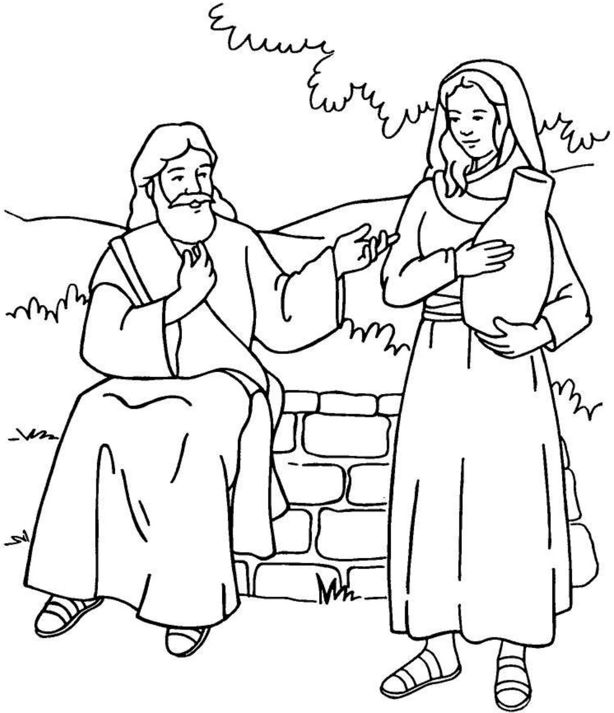
Jesus and a Samaritan Woman John 4