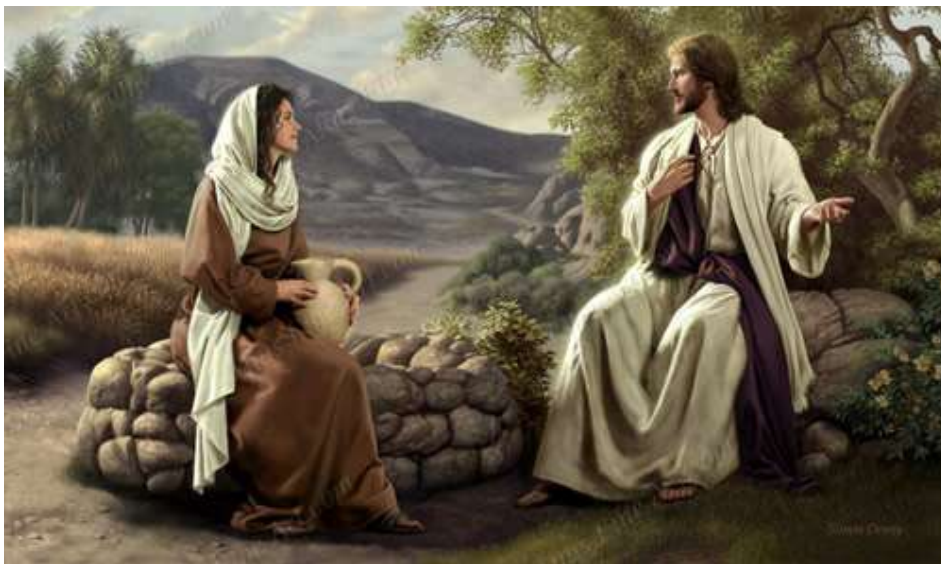
Jesus explained to a sinful woman how he could give her 'living water.'