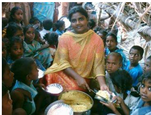
Christians everywhere serve the needy, as Jesus did.