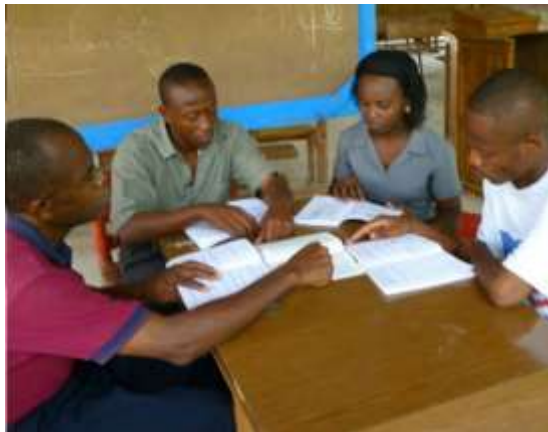
Workers prepare to go on mission to neglected communities.