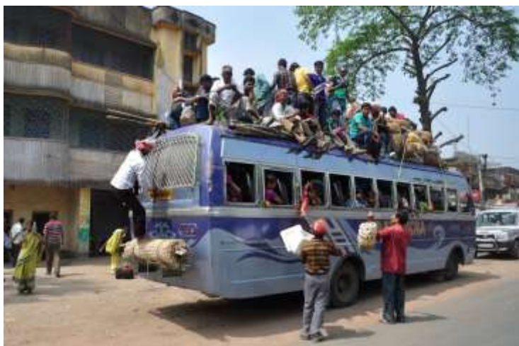
Workers travel on mission to neglected communities.