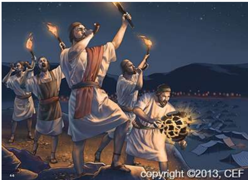
Gideon's men shone torches and sounded horns, frightening away a strong enemy.