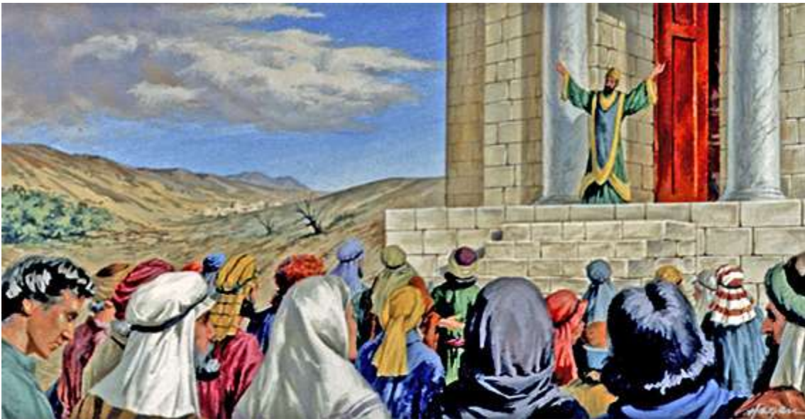
When enemy armies threatened his country, King Hezekiah called everyone to return and worship the LORD.