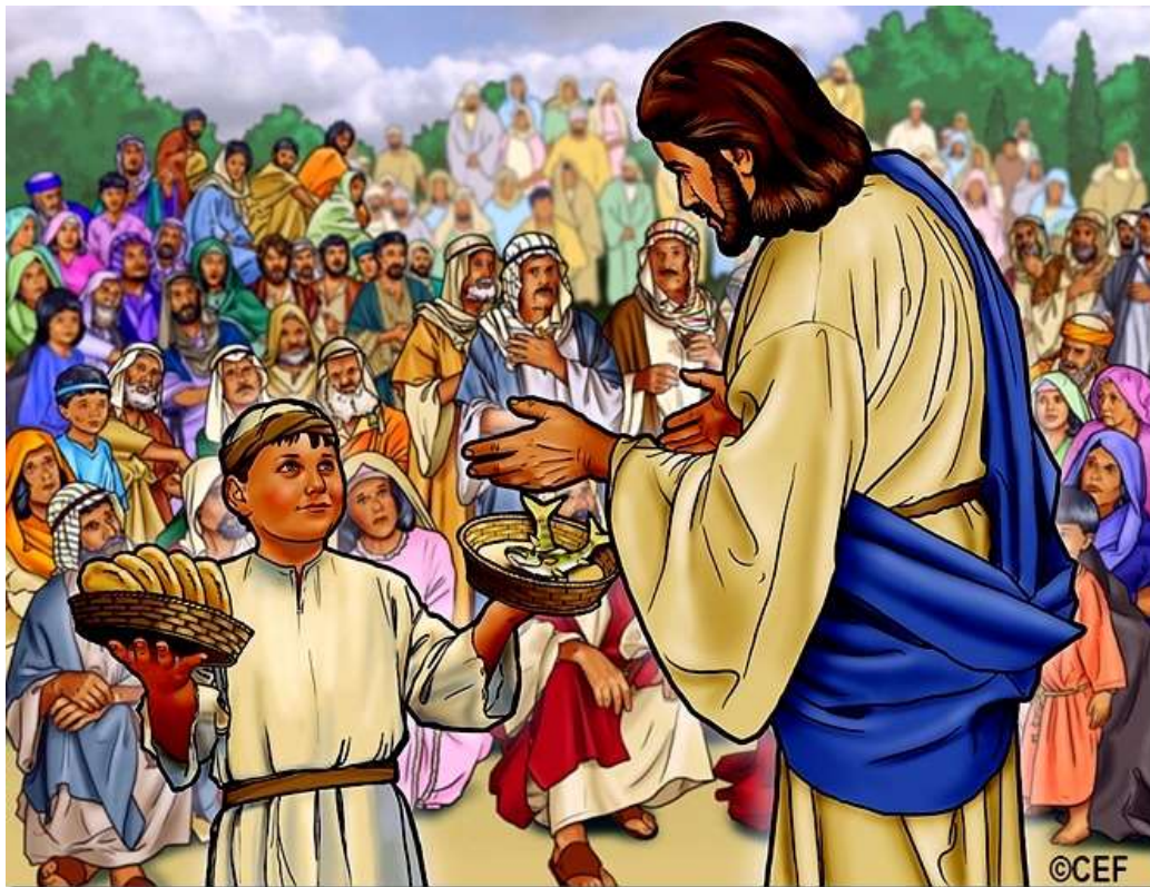
A boy offered his bread and fish to Jesus who multiplied it to feed 5,000 men.