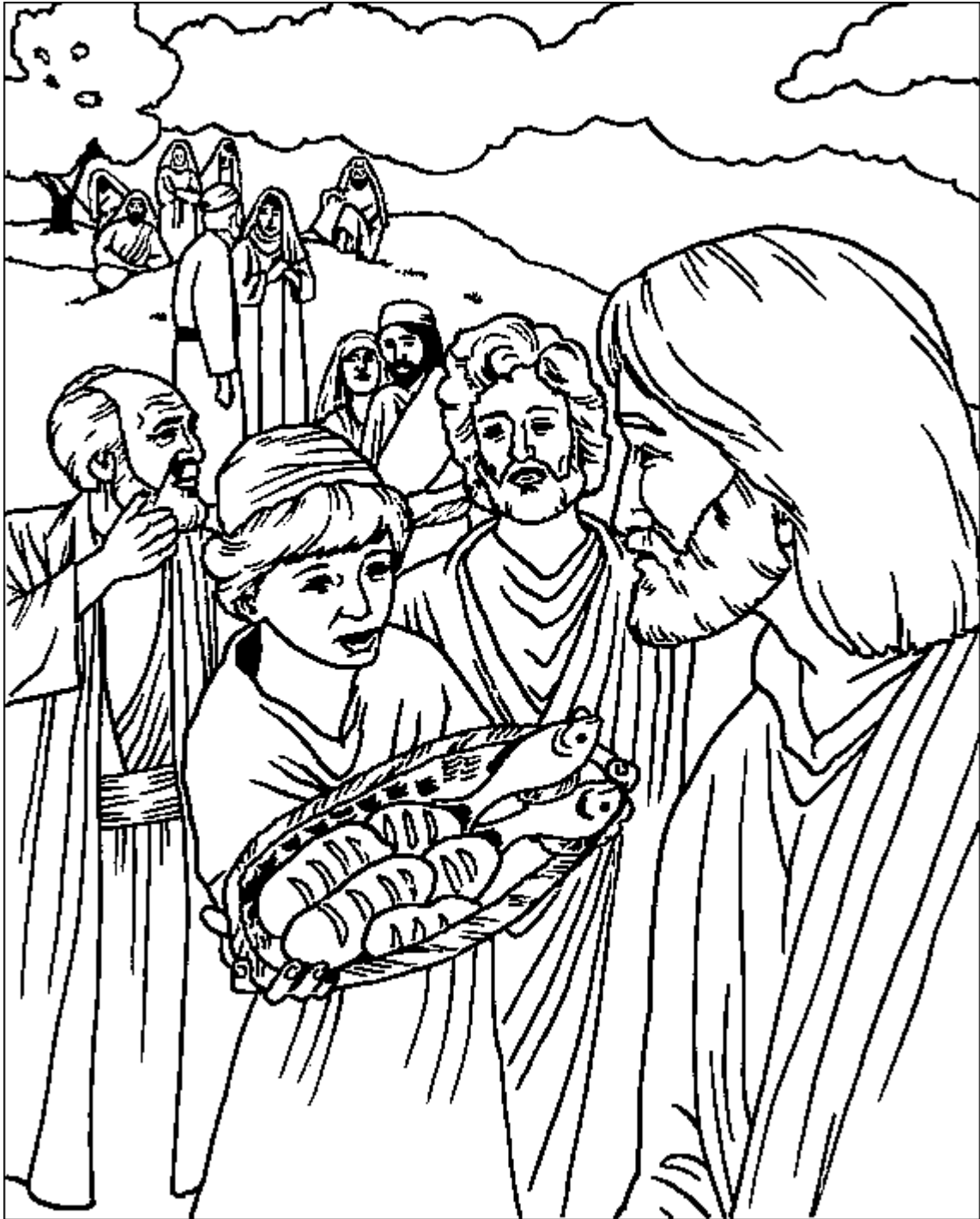
A lad offered his bread and fish to Jesus who multiplied it to feed 5,000 men.