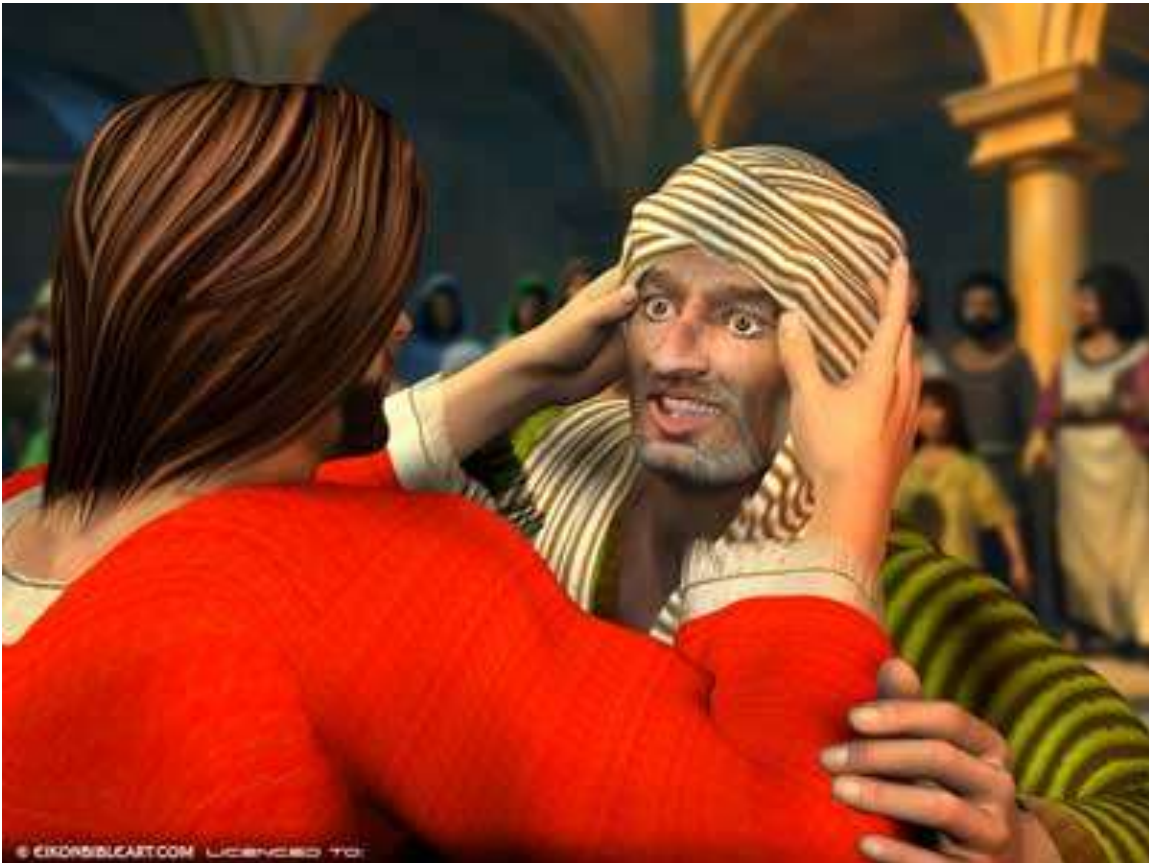
When Bartimeus cried out to Jesus, the Lord called him and gave him his sight.