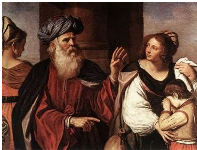
Abraham sent away the slave Hagar and her son Ishmael. Thus, Isaac was reckoned Abraham's only son and heir.