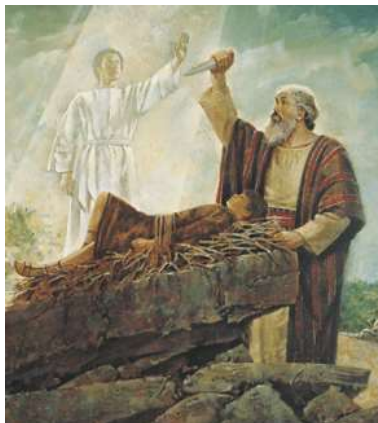
When Yahweh saw Abraham's obedience, an angel kept him from harming Isaac.