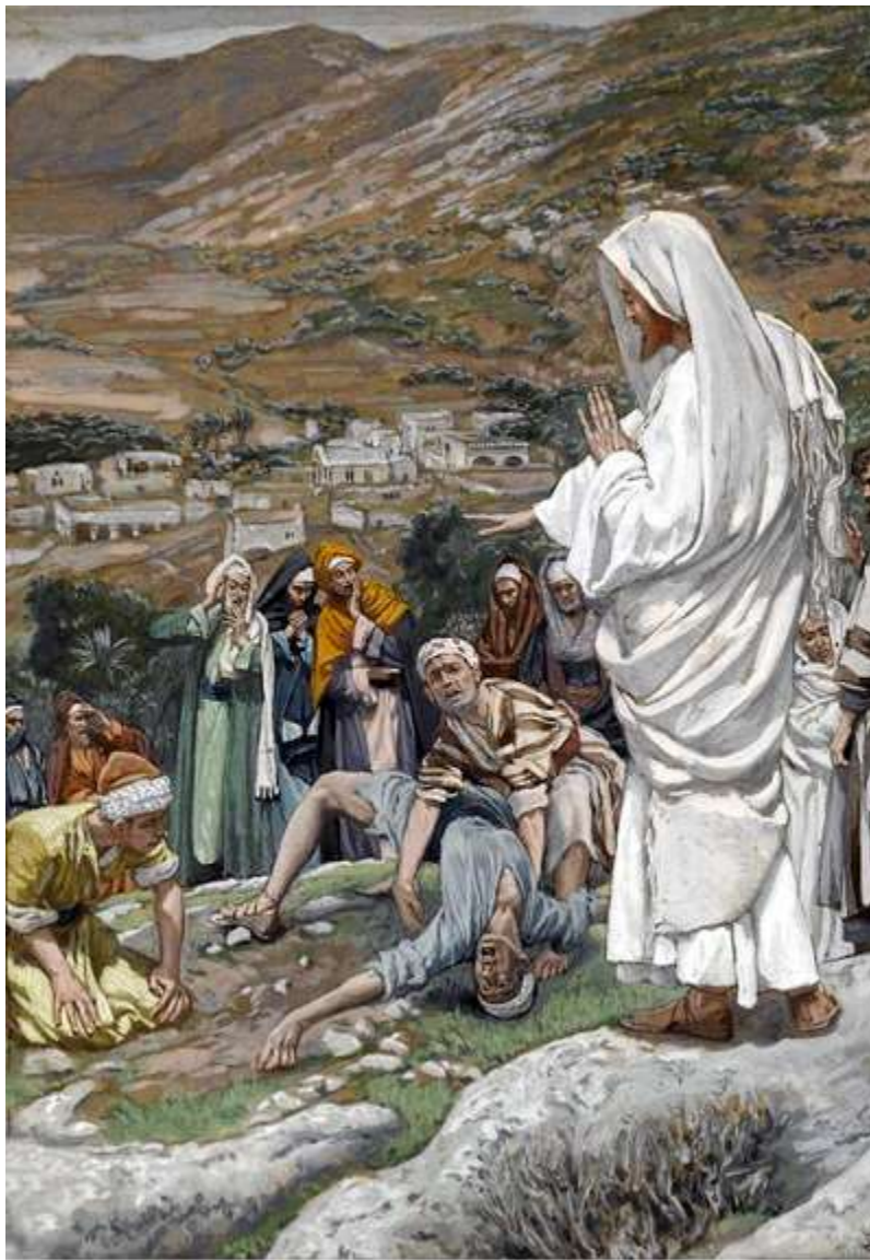
The Possessed Boy at the Foot of Mount Tabor by James Tissot

This story shows how Jesus has power over all the forces of Satan.