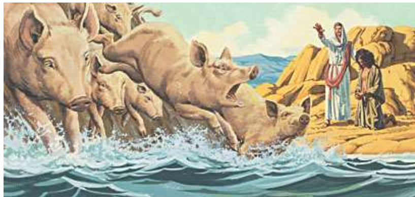
Jesus drove out of a man several demons that then drove swine into a lake.

A good way to teach people about God is simply to tell them, in your own way, what Jesus has done for you. Tell it in the same way that you would tell any good news, such as finding a very precious pearl.