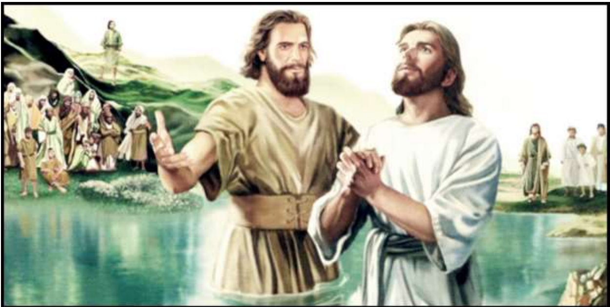
Jesus came to John, asking him to baptise him. We follow Jesus by asking to be baptised.