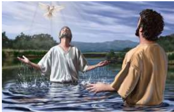
When John baptized God's Son Jesus, he heard God's voice and saw God's Spirit.