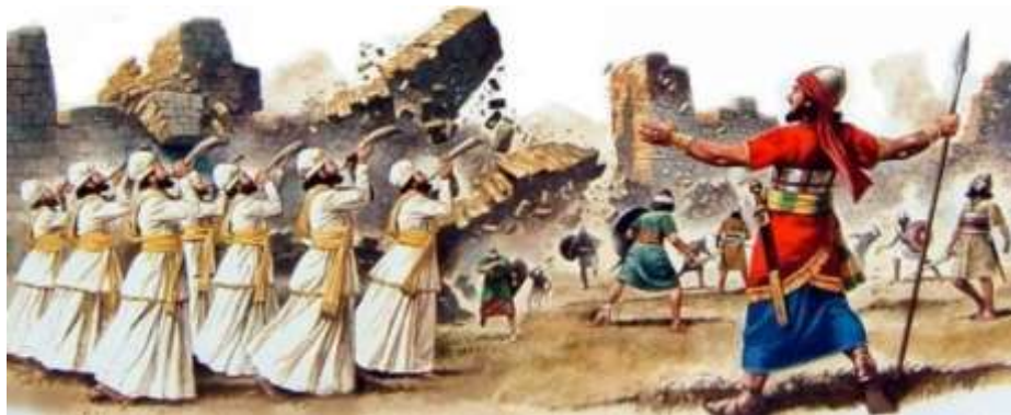
The walls of Jericho start to crumble. See Joshua 6:15–20