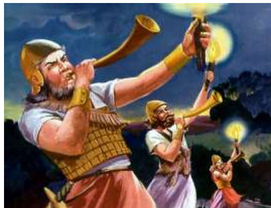
Gideon’s brave men prepare to attack