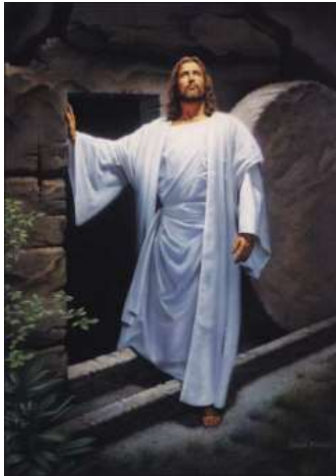
Third day after he died, Jesus came back to life and left his burial tomb.

Choose any or all of these children's activities.