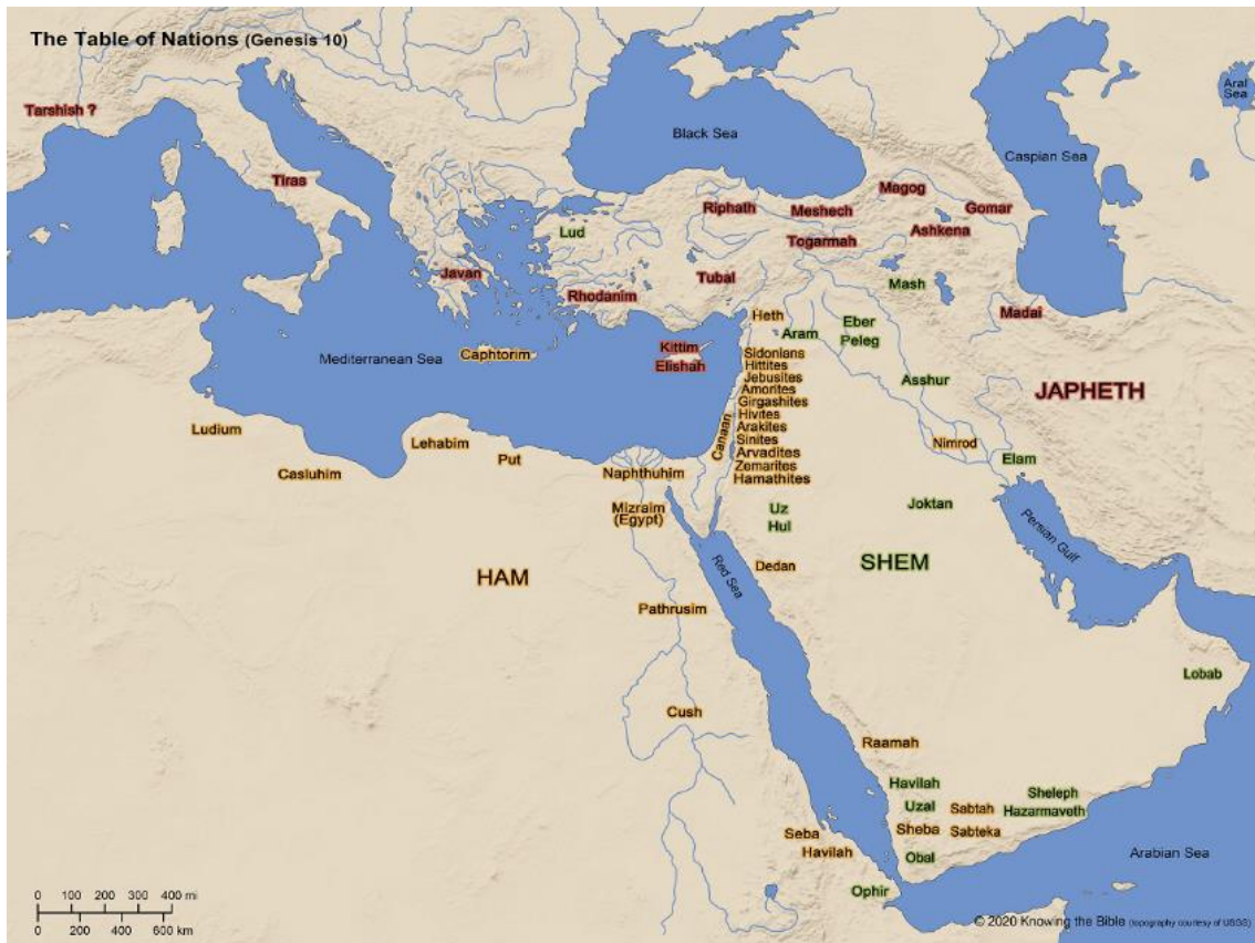
(c) 2020 Knowing the Bible LLC. Free.

Table of 70 or of 72 nations listed in Genesis 10 “spread out over the earth after the flood” (32).