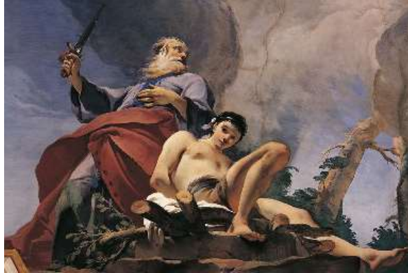
Abraham obeyed God, and his son Isaac was spared.

[Answer: The ram was an innocent victim whose blood was shed to save another. This, like many other Old Testament people and events, served as a picture of Christ, long before He came to earth. These examples were to prepare people to receive Jesus when He would come.]