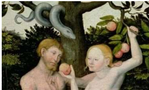
Adam and Eve chose to obey a serpent instead of God.