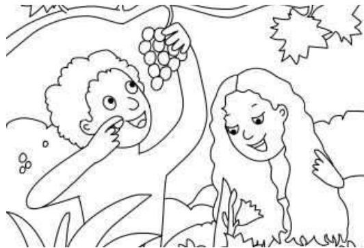
The first man and woman found abundant food in the garden where the Creator put them.