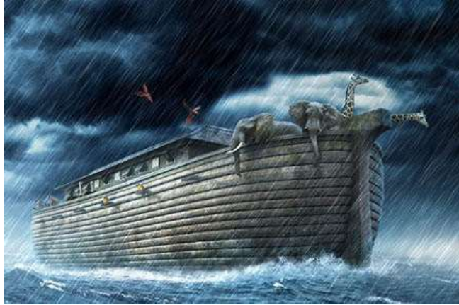
Noah obey God by building a boat to save his family and many creatures.