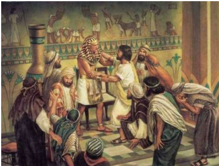
Joseph obeyed God in Egypt, and was able to save his parents and brothers.

[Answer: Joseph was one of the original “children of Israel (Jacob)” who rejected Him out of envy. His father loved him greatly. He was obedient. His own people sold him (like Judas sold Jesus). He was taken to Egypt. He was falsely accused and put in prison. He rose to a position of power at the right hand of the king. In that position of power, he saved his brothers who had rejected Him. He revealed Himself in a glorious way at a great banquet.]