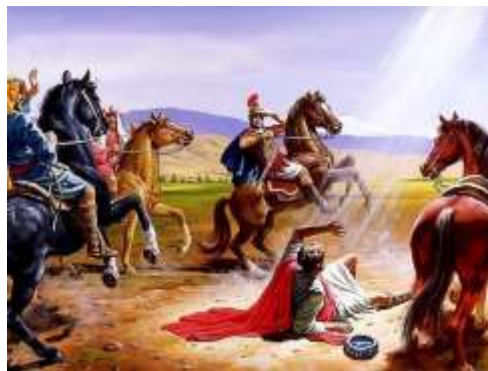
Saul fallen from his horse at the appearance of Jesus