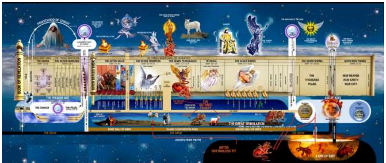
The Book of Revelation paints many exciting pictures of the end times.

[Death, hell, crying, night, sun, moon, sin, sickness]